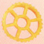
Wheel N. 760 mm / 16 righi 32