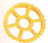
Wheel N. 760 mm / 16 righi 32