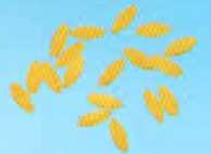
Rice N. 301 mm.