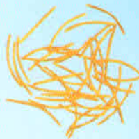
Vermicelli N. 956/02 mm. / 0.9