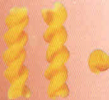
Spirals N. 763 mm / 6 a 2 P.