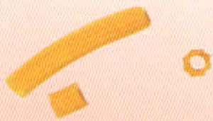
Small Rings N. 594 mm / 65 righi 10