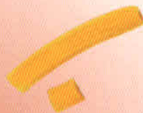
Small Rings N. 594 mm / 165 righi 10