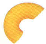
Elbow N. 708 mm / 6 righi 8