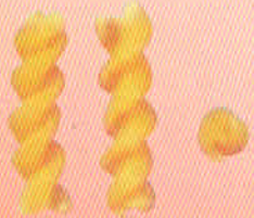
Spirals N. 783 mm / 8 a 2 P