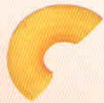
Elbow N. 708 mm / 6 righi 8