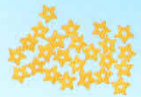
Star N. 594 mm. / 6.5 right 10