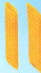
Penne N. 974 mm. / 9 right 32