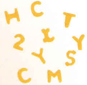
Alphabet N. 858 mm / 6