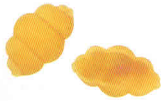
Shells N. 775/01mm / 20