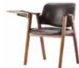
LIBRARY WITH TABLE