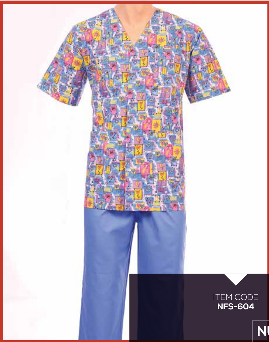
ITEM CODE NFS-604