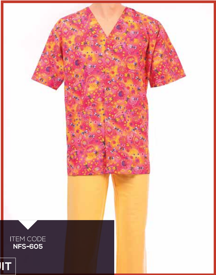
ITEM CODE NFS-605