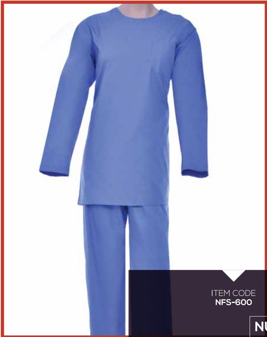
ITEM CODE NFS-600