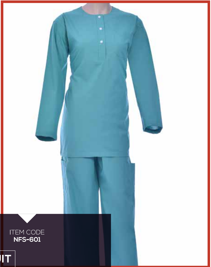
ITEM CODE NFS-601