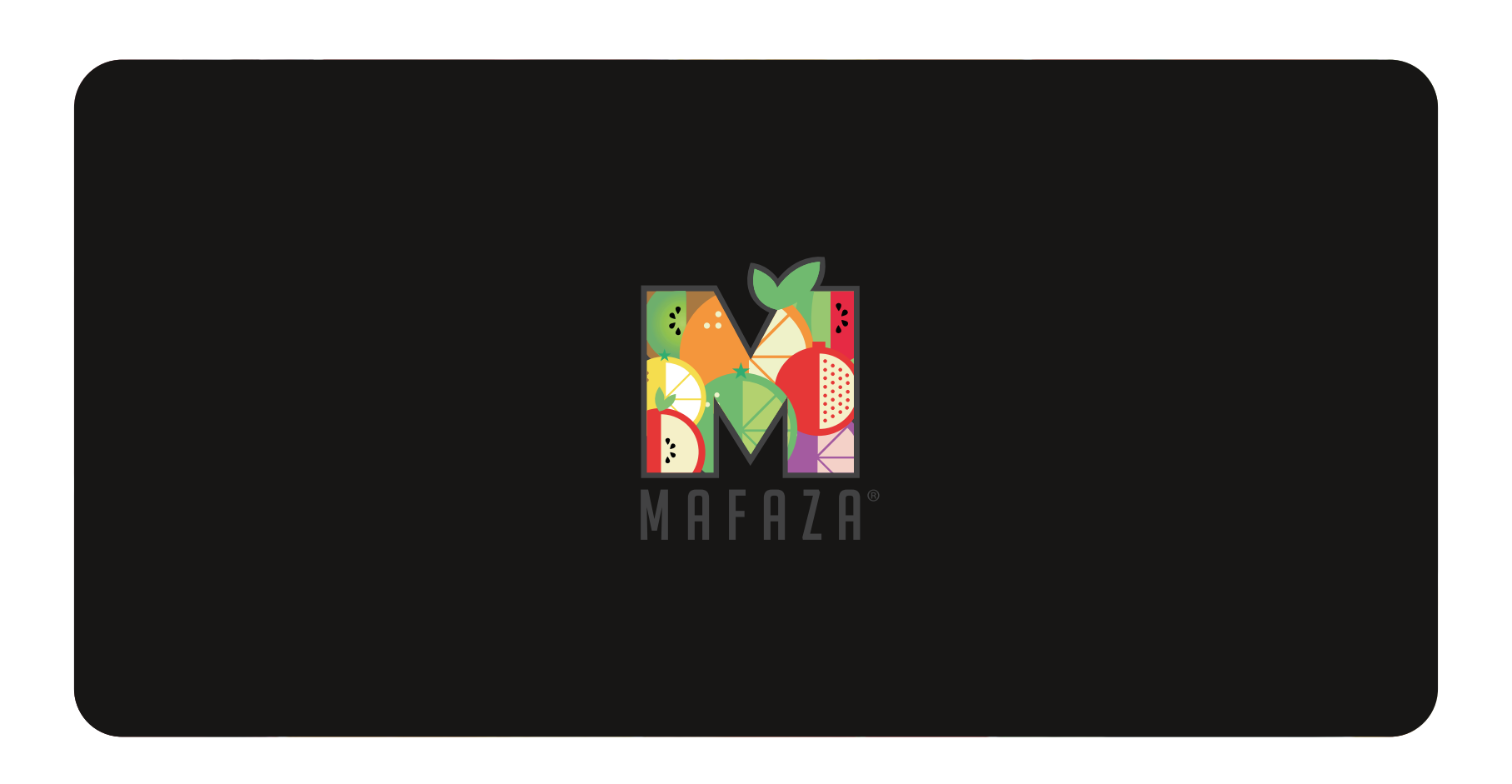
Global Leading Supplier For Fresh Produce