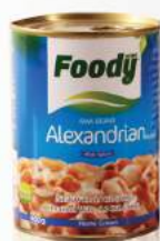
Alexandrian Recipe with Tahini بالخلطة الأسخندرانى (طحينة) 400g