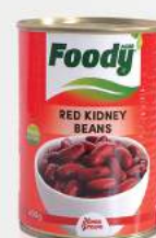
Red Kidney Beans فاصوليا حمراء 400g