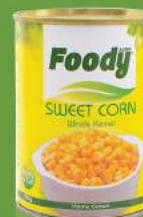
Sweet Corn ذرة حلو 400g