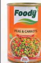
Peas & Carrots بسلة بالجزر 420g