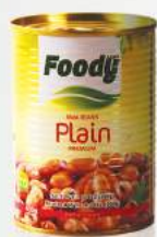
Fava Beans Plain فول ساده فاخر 400g