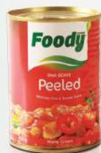
Fava Beans Peeled with Hot Chili Sauce مقشور باللفل الحار و الصلصة 400g