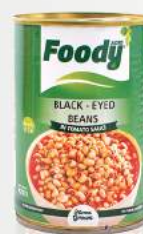
Black-Eyed Peas in tomato sauce لوبيا 420g