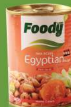
Egyptian Recipe with sauce بالخلطة المصرى 400g