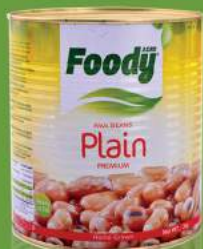
Fava Beans Plain فول ساده فاخر 3k