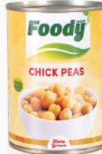
Chick Peas حمص مسلوق 400g