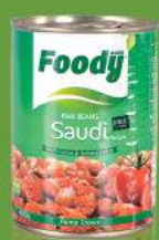
Saudi Recipe with cimin sauce بالخلطة السعودى كمون و صلصة الطماطم 400g