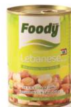
Lebanese Recipe Chickpeas, Tahini Olive oil بالخلطة اللبنايى 400g