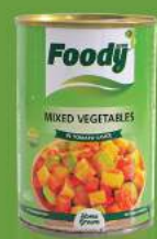
Mixed Vegetables خضار مشكل 420g