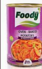
Oven-Baked Potatoes صنية بطاطس 420g