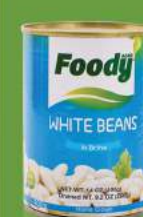
White Beans فاصوليا بيضاء 400g