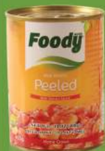
Fava Beans Peeled مقشور بالصلصة 400g