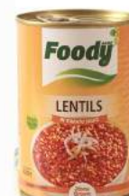
Lentils عدس بجبة 420g