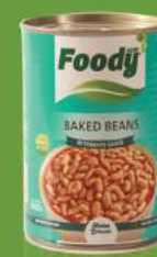
Baked Beans فاصوليا بيضاء في صلصة 420g